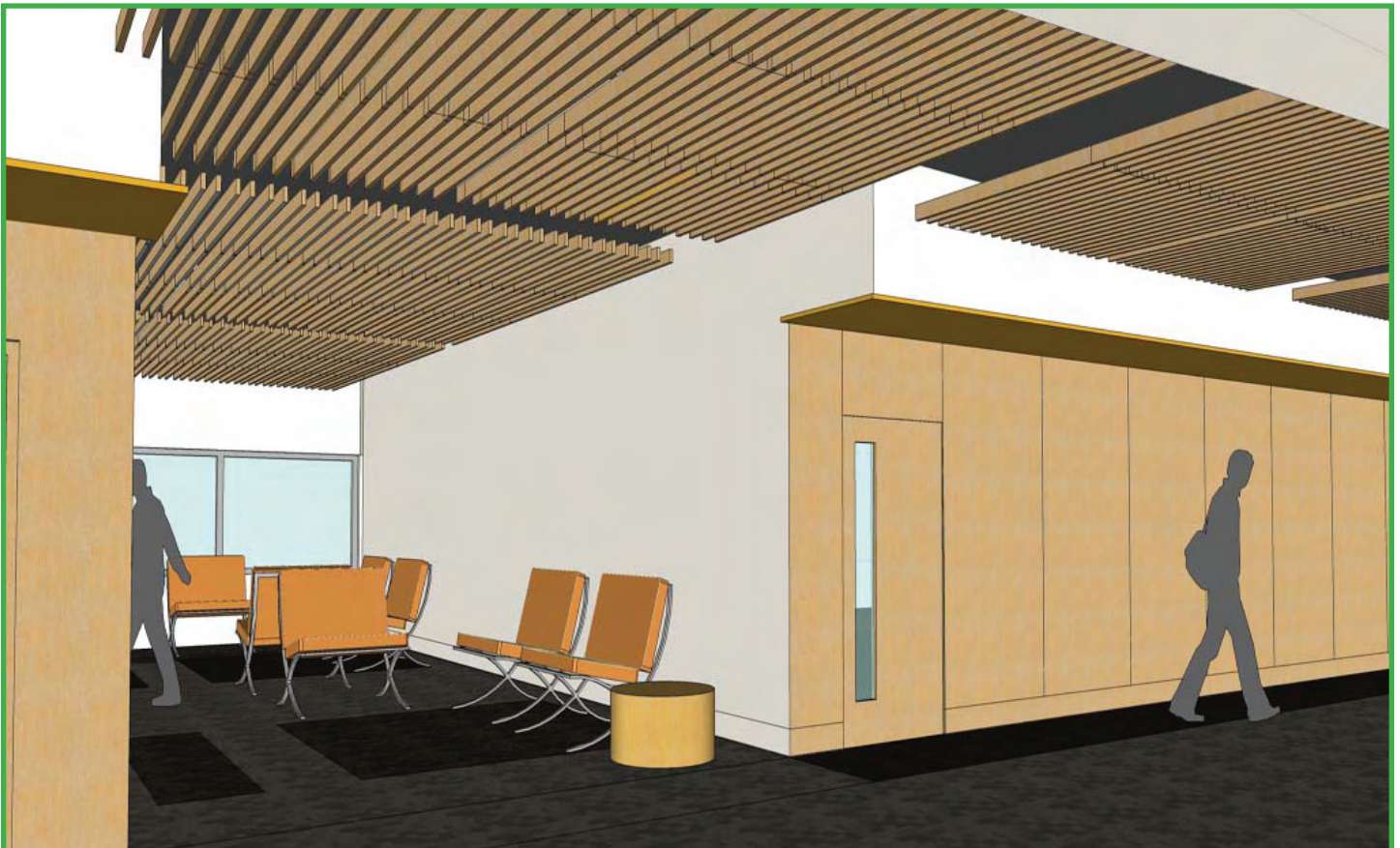
The use of natural wood is featured throughout the design of 800 Pike.