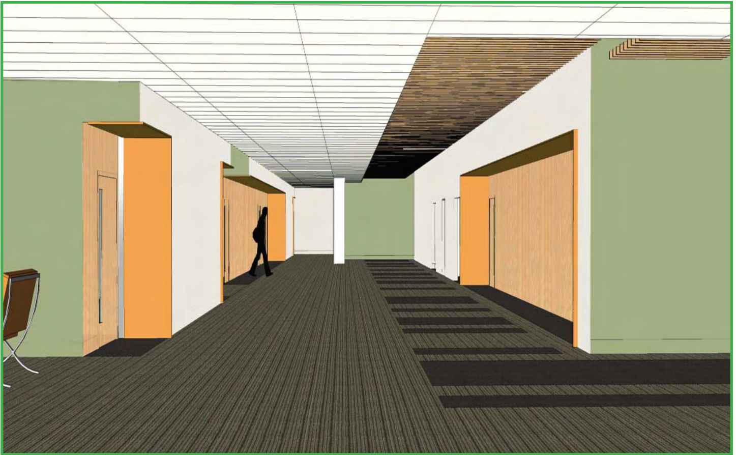
Concept rendering showing lobby and pre-function space on Level 2.